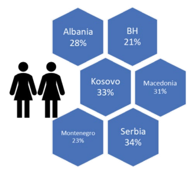
Figure 2: Number of female MPs in the Western Balkan countries